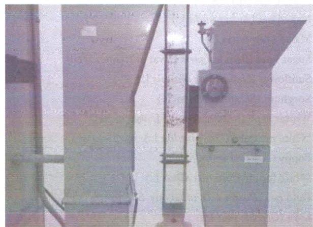
Fig. 1. A part of the laboratory K-293 air sorting machine with the vertical aspiration duct

Seed samples acquired from the Oseva Uni a.s. company and samples supplied by the experimental station of the Faculty of Agrobiolgy, Food and Natural Resources affiliated to the Czech University of Life Sciences in Prague were used to measure aerodynamic properties of seeds. A laboratory K-293 air sorting machine (VEB Kombinat Fortschritt; Anlagenbau Petkus, Wutha, Germany) with the adjustable flow volume of air streaming through the vertical aspiration duct of the sorting machine was used for these measurements (Fig. 1). Four repeated measurements were done in all seed samples. Weight of each sample was 200 g. The whole sample was sorted gradually by increasing air velocity of about 0.55 m/s in the range from